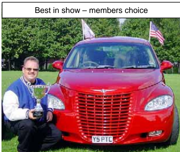
Best in show – members choice