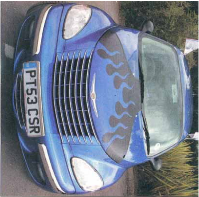
● Mean machine – Chris Wilson's pride and joy.

A RECORD number of souped-up American Chrysler PT Cruisers cruised the country lanes of Essex in a dazzling display of chrome and colour.