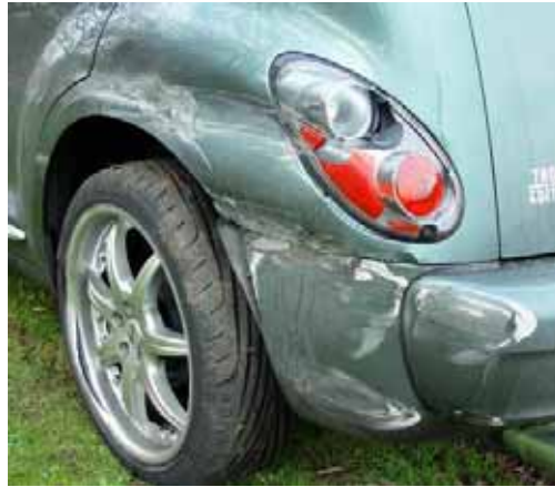
Crash protection - door side bars