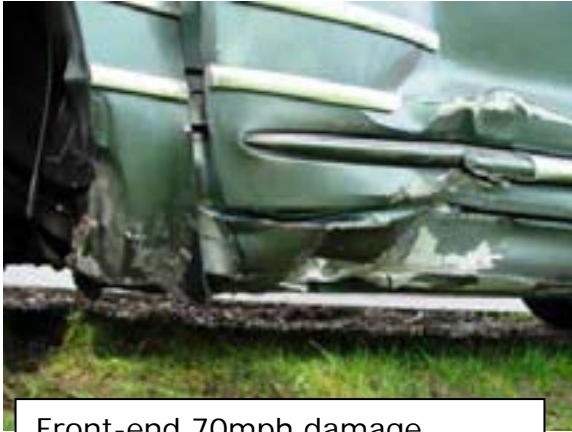
Front-end 70mph damage, steering broken, radiator back about 2 feet